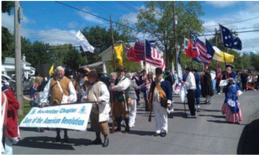
Waterloo Parade, 2013